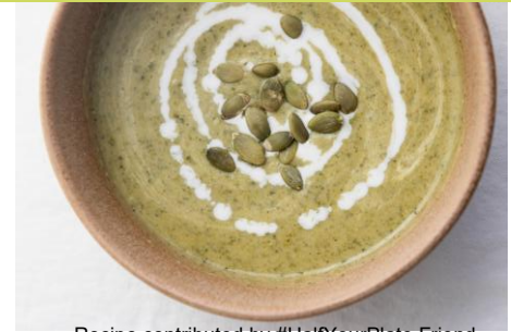
Recipe contributed by #HalfYourPlate Friend MayEightyFive.com

This broccoli soup recipe is loaded with fresh veggies like broccoli, potatoes, and kale. It's the perfect healthy soup recipe for anyone looking to sneak more vegetables into their day in the most delicious way possible. It's super easy to prepare, freezer-friendly, and the kind of recipe that makes you feel good after every bowl.