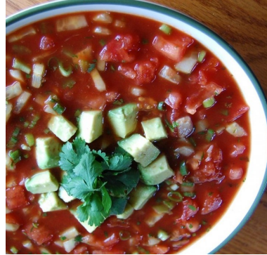
Recipe and photo from: https://www.cookingmamas.com/gazpacho-soup