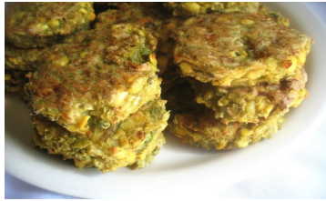
Recipe from Cookspiration.com