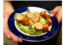
CC BY-NC-SA 2.0 DEED

BOERENKOOL STAMPPOT – a delicious and traditional Dutch recipe that uses both kale and potatoes! The vandenHurk family (our Clearview pack coordinators) share this hearty and easy winter dish recipe that uses local, fall vegetables. It's their granddaughter's favourite! Wash one bunch (about 12 oz/340 grams) kale leaves. Remove the stems and roughly chop the leaves in ½ inch or 2 cm strips. Cover with water and boil for half an hour. Meanwhile, peel and halve 6 potatoes. Add them, along with 5 Italian sausage to the boiling pot of kale and continue cooking until the potatoes are soft. (about half an hour). Drain the liquids. Remove the sausage. Mash the potatoes and kale together with ¼ cup or 57 grams butter. Serve the stamppot with the sausages and vinegar (if desired). Change it up by substituting carrots and onions for the kale, then it's Hutspot!